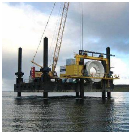
Fig 1 OpenHydro's turbine being sited at the EMEC test site in the Orkneys

megawatts (MW) - 80% of the UK's generating capacity - flow up and down the Channel daily though a more likely prize is the Pentland Firth where the flow reaches 3 million tonnes of water/second.