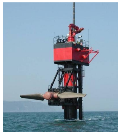
Fig 3 The Seaflow turbine raised for maintenance

The number of other devices is increasing rapidly.